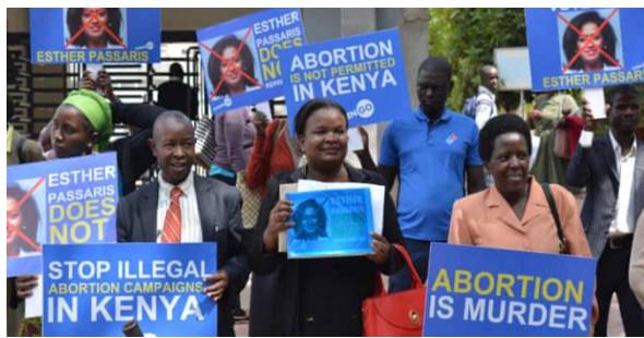
CitizenGo campaigning in Kenya (2021)

The examples are ample, like one that CitizenGo started in 2021 in Kenya to 'defend the lives of the unborn', and one against the United Nations to 'stop the United Nations from corrupting our children' because 'the UN is outright against us' for the 2023 Commission on the Status of Women (CitizenGo, 2021; CitizenGo 2023). The petitions are still open for signatures.