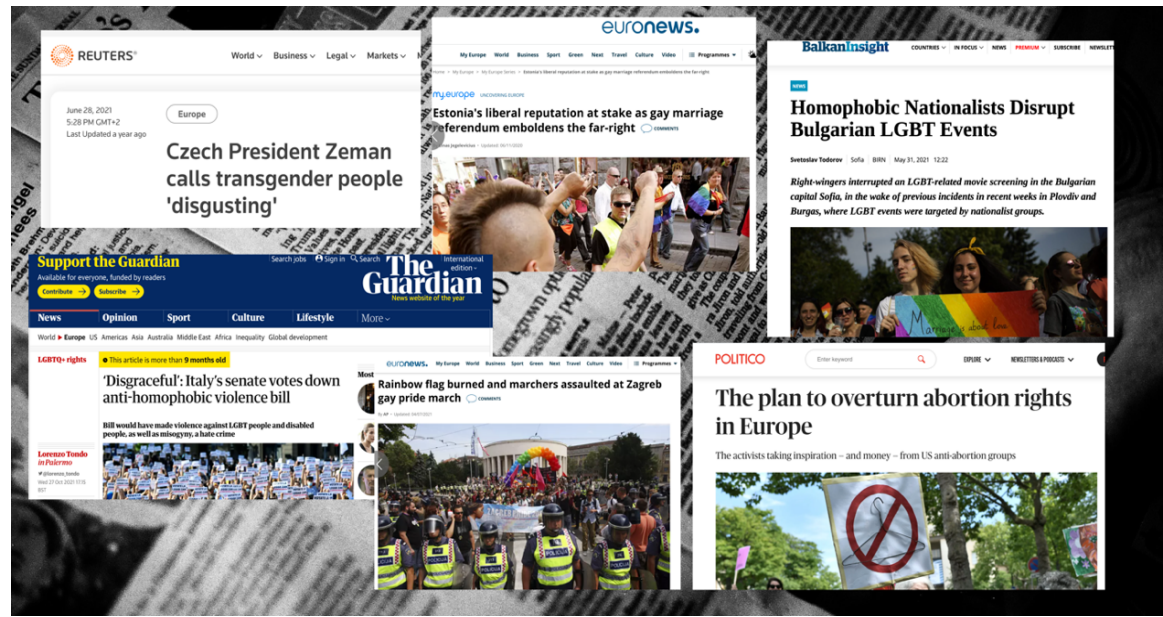
News clippings compiled by JfP

It is becoming more dangerous for more people just to be. Our open societies, democracies, and ordinary citizens are threatened by targeted undermining by anti-democratic actors and activities. Every day across Europe, people risk their lives and/or livelihood to report on, advocate for, defend, and protect our democracies, our rights, and our freedoms. Journalists, rights defenders, scientists, teachers, and ordinary people going out to vote, are under siege from subversive powers. We see them attacked in the courts, online, and on the streets. Most of the time, they don't even know by whom. Other times they are painfully aware they are up against powerful forces like an oligarch, kleptocrat, or autocratic government, but don't know how to defend themselves. This highlights how uneven the playing field is, and this gap allows subversive powers to exploit vulnerabilities.