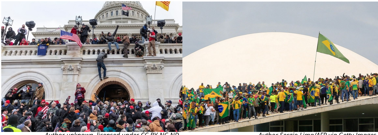
Author unknown, licensed under <u>CC BY-NC-ND</u>

Our considerations refer where possible to (known) hate speech, conspiracy theories, dis/mis/malinformation.